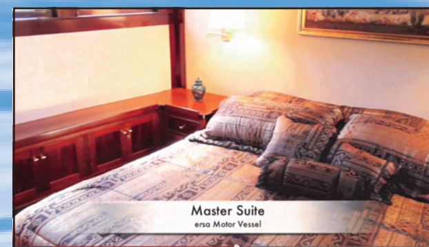
Master Suite ersa Motor Vessel