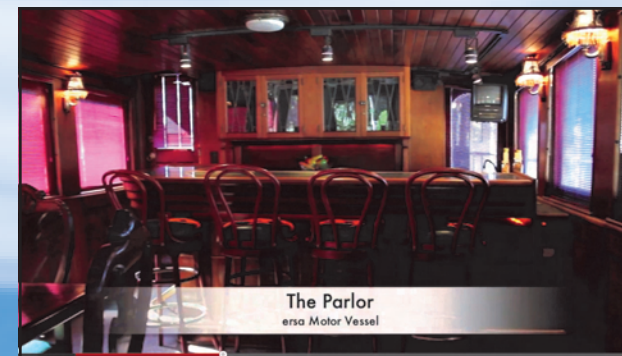
The Parlor ersa Motor Vessel