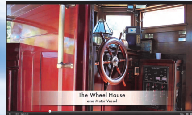
The Wheel House ersa Motor Vessel