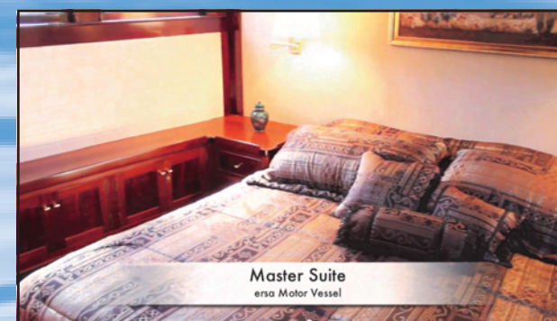
Master Suite ersa Motor Vessel