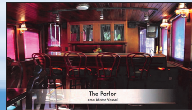
The Parlor ersa Motor Vessel