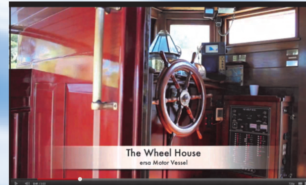
The Wheel House ersa Motor Vessel